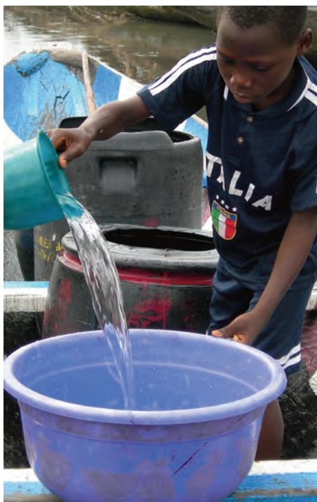
Above: Collecting water at Lake Nokoué

The Lake Nokoue project aims to widen access to clean drinking water for the villages around Lake Nokoue in Benin. Companion Mike reports on the project progress meeting he attended at Emmaus International in Paris: