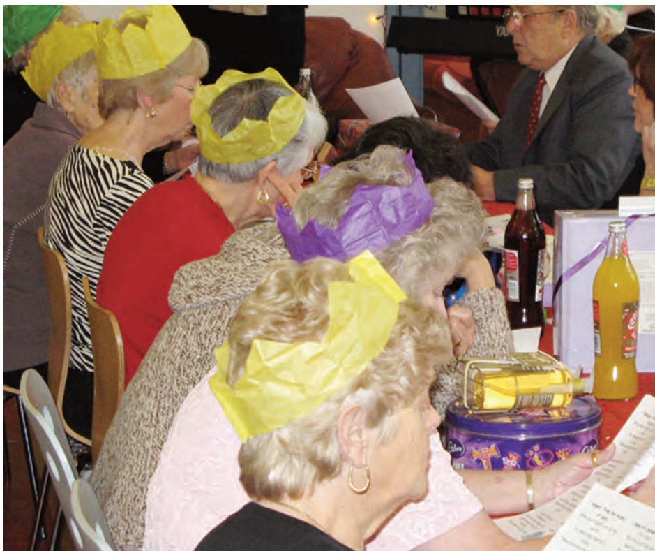
Above: A Christmas dinner at Shaftesbury House for local residents

At the close, all our guests were given an Emmaus "Bag for life" with a sandwich, mince pies, fruit and chocolates and the Emmaus Bristol Newsletter.